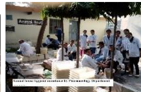
Animal house hygiene maintained by Pharmacology Department