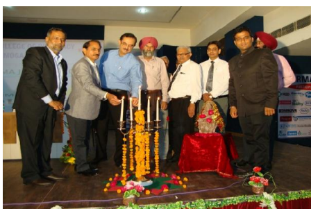
Guests at lamp lightening ceremony