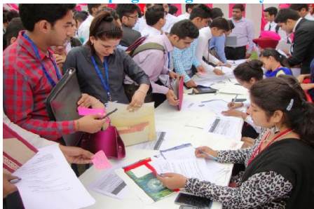
Students at registration counter

I.S.F. College of Pharmacy (ISFCP), Moga, among the top 5 pharmacy institutes in India as rated by AICTE-CII, organized a first ever 'Pharma Job Fest' for the passed-outs of diploma, degree and masters' degree holders in pharmacy from all over India at Moga (Punjab) on 7 th April, 2015. At this occasion, 38 reputed pharmaceutical companies and hospitals from all over India participated to recruit 600 pharmacy graduates. Almost 1200 graduates participated at this event. The program was inaugurated by IAS, V.K. Meena, Commissioner, Faridkot (Punjab) as chief guest. The inaugural function was presided over by Dr. Buta Singh, Dean (Academics), PTU Jalandhar and Dr. Sandeep Puri, Principal, DMC & H, Ludhiana. Mr. Vir Vikram, Chief Pharmacist, DMC & H Ludhiana; Mr. Parveen Garg, Chairman, ISFCP; Er. Janesh Garg, Secretary, ISFCP; Prof. N.K. Jain, Dr. P.D. Juyal, Dr. Ranjeet Singh and Dr. Ashish Baldi were also present.